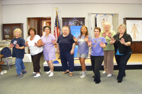
Six Healing Sounds of T'ai Chi Chih-- All together!

NEXT STEP STRATEGIES, LLC A Holistic Approach to Health & Vitality